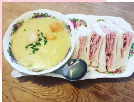
Our Delicious Homemade Soup and Sandwich

We pride ourselves on our Homemade and locally sourced food as well as the great service our customers come to expect from us. We strive to be the very best and be the number one place to visit in the area.