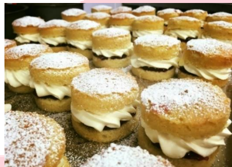
Freshly baked Mini Victoria Sponge Cakes